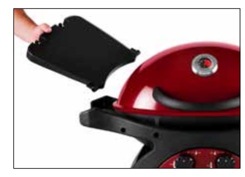
Two shelves are provided and are easily fitted into the corresponding slots located on both sides of the barbeque