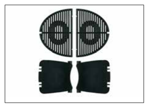
Installation is simple and only requires putting the two cooking grills in place and fitting the right and left hand shelves.