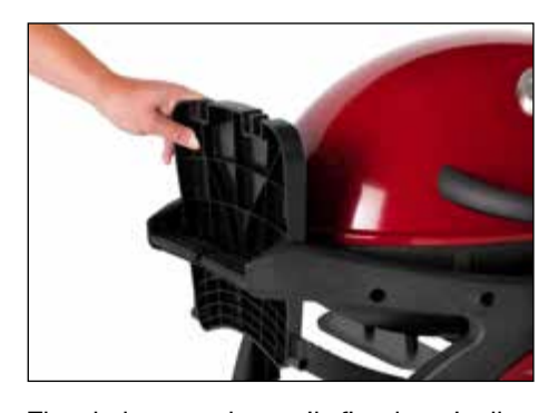
The shelves can be easily fitted vertically for transport or storage. Attach the match holder and chain provided to the cross brace on the left side of the BBO.