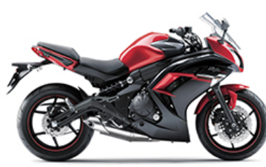
Candy Persimmon Red with Metallic Flat Spark Black