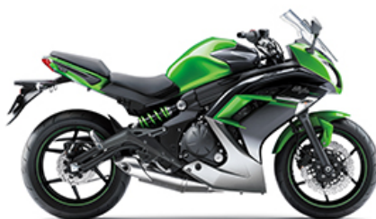
Candy Lime Green Type 3 with Metallic Flat Spark Black & Galaxy Silver

Talk with your local Kawasaki dealership to find all of the latest Kawasaki Ninja 650L ABS accessories, Kawasaki Clothing and Kawasaki Merchandise.